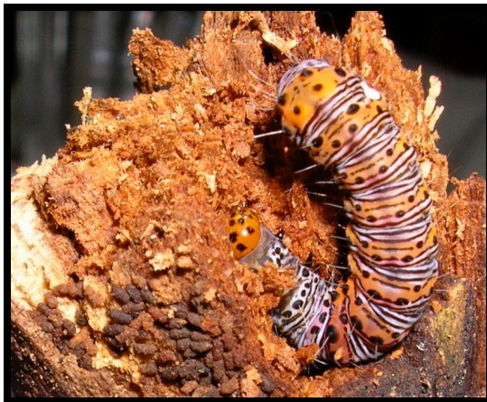
Eight-spotted Forester caterpillar getting ready to tunnel into rotten wood

One summer I was lucky to find an almost grown caterpillar of this species. When it quit eating the Virginia Creeper leaves I provided and started wandering around in the jar in which it was "lodged", I looked for a dead branch to add to the jar. Like clockwork, it started to burrow into the broken end of the branch, giving me a chance to take photos of the process.