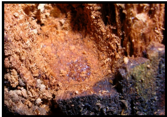
Ta-da, all gone!

Checking the jar on a daily basis in spring, I missed the actual emergence of the adult, but there was the moth and the hole in the end of the branch.