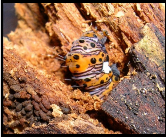
Keep digging, just a little further