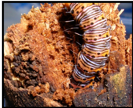
Starting to excavate