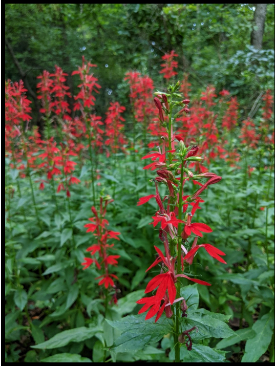
Cardinal Flower ( Lobelia cardinalis ) Q.Edwards

What more substantial service to conservation than to practice it on one's own land?--Aldo Leopold