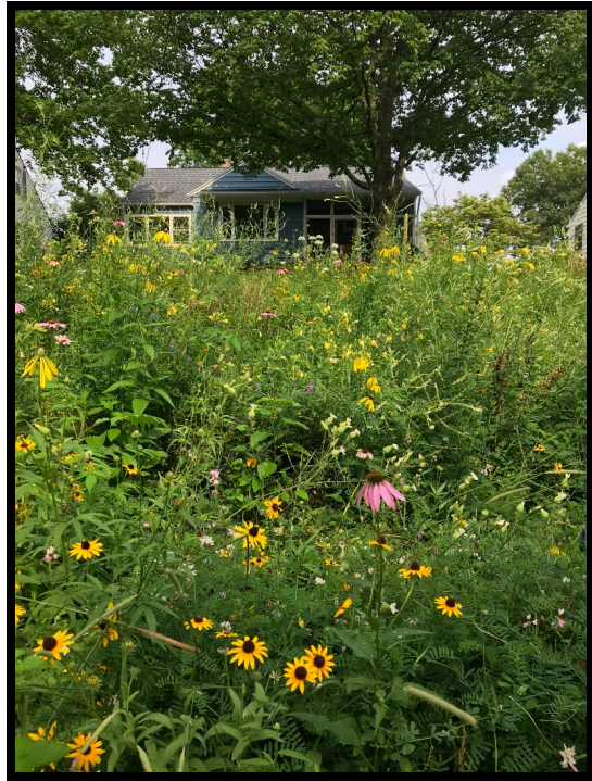
Wildflower Planting M. Luna

If you are interested in including your garden/yard in this presentation, please contact Ruth ( rdecann47@gmail.com or 269-207-2815). Also, if you know of a garden/yard you think should be included, please let Ruth know.