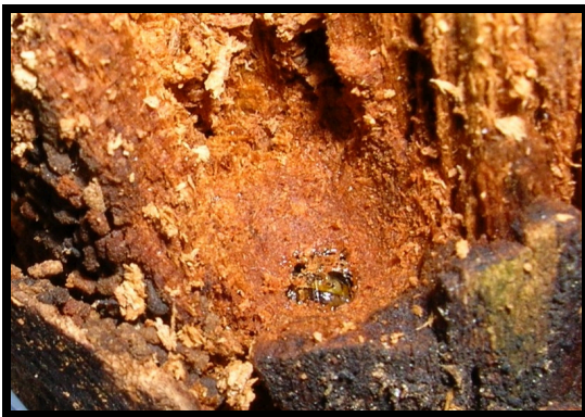
Now for closing up the hole