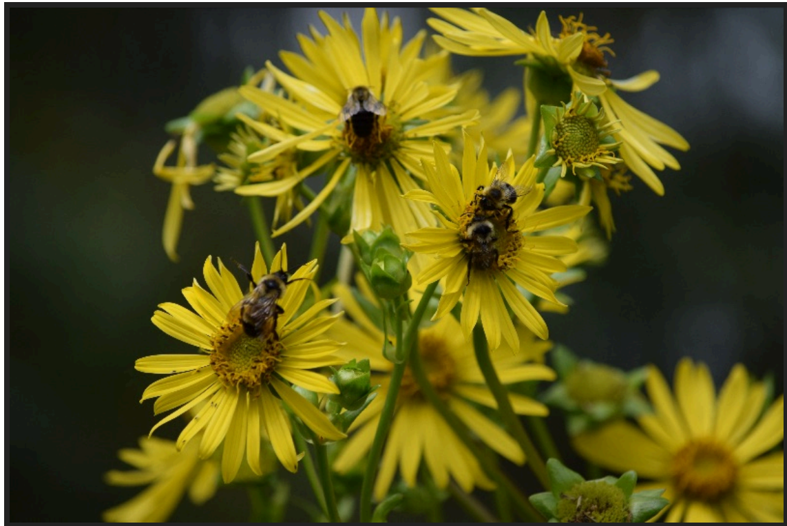
Cup Plant (Silphium perfoliatum) Q.Edwards