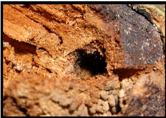
After overwintering moth has emerged

Checking the jar on a daily basis in spring, I missed the actual emergence of the adult, but there was the moth and the hole in the end of the branch.