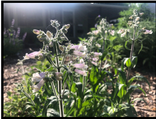
Pentemon hirsutus M. Luna

Each month this summer, KAWO members with native plant gardens will offer tours organized by neighborhood. We begin June 4 in the Westwood East neighborhood in Kalamazoo County. This is an open-house style tour; stop by in any order you wish. For a map and garden descriptions, click here .