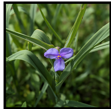
Tradescantia ohiensis B. Bradburn