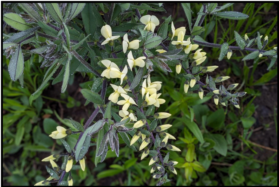
Cream Wild Indigo (Baptisia bracteata), KAWO Community Projects site B. Bradburn