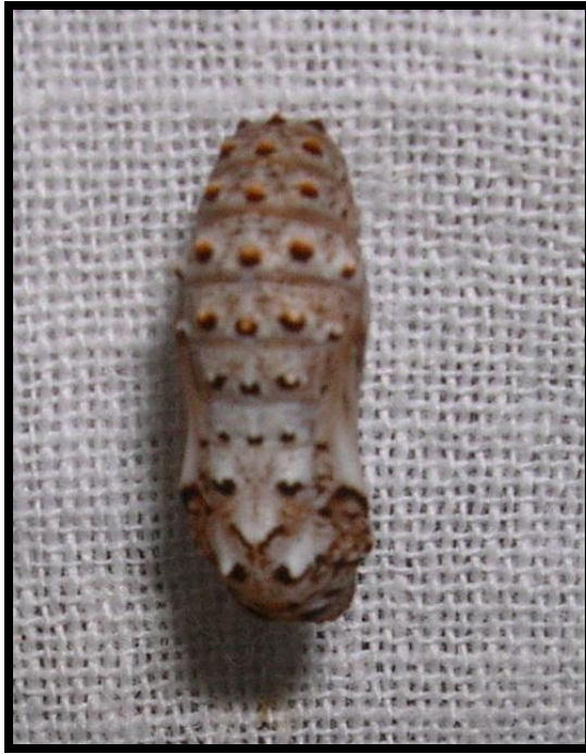
Silvery Checkerspot chrysalis I. Gebhard

I learned that at our latitude the Silvery Checkerspot can have either one or two generations. In mid-summer some of the caterpillars go through metamorphosis to the butterfly stage the same year, like the one specimen did. Others, like the 19 that had quit feeding, find shelter at the soil surface under the host plant, where they become lethargic and hibernate until the following spring. In spring they arouse, and for a few weeks, feed upon the tender leaves of the new growth and then complete their metamorphosis to adult by late spring or early summer. What a marvelous adaptation for the survival of the species. If the caterpillars of the first generation don't survive to become adults the next spring, there are those of the second generation that might, and vice versa.