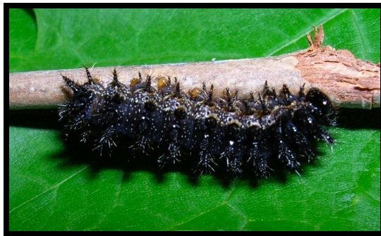
Silvery Checkerspot caterpillar